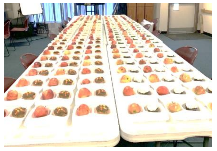
St. Andrew volunteers fix 150 trays with an apple and a cupcake, and then add soup and crackers.